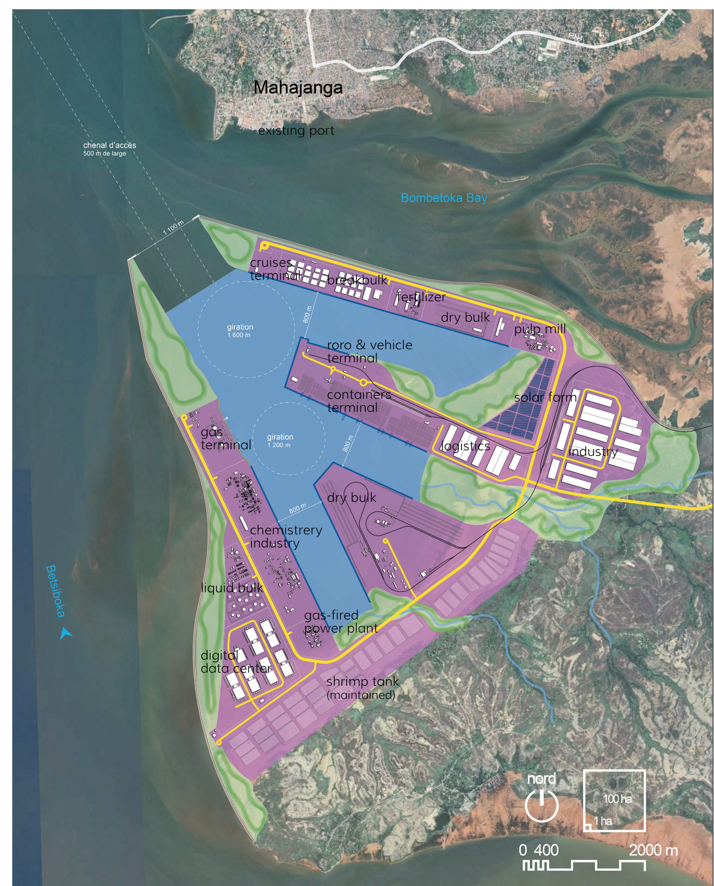
Masterplan of the new port of Mahajanga